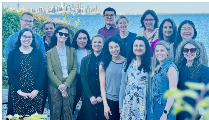
The CanRIO group at their most recent meeting in Toronto in May 2024.

As we celebrate our five-year anniversary, we would like to reflect on our accomplishments and review our goals for the future. Since our inception, members of CanRIO have completed and published a national needs assessment and multiple review articles, which have guided our research agenda. We have established a national prospective cohort with clinical and biological data from over 300 patients and a national retrospective cohort with over 500 patients. The data from these two cohorts have been used to describe emerging rheumatic irAEs, and to evaluate the impact of patient and treatment factors on autoimmune and cancer outcomes.