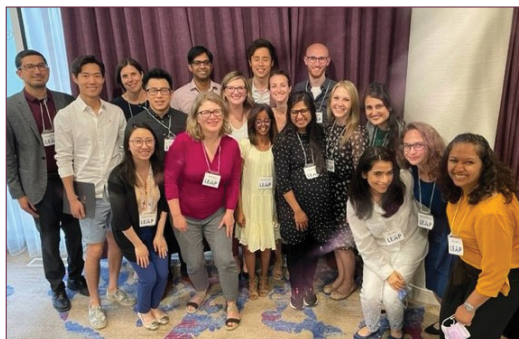
LEAP 2020-2022 cohort at their final meeting.

The Continuing Professional Development (CPD) subcommittee has renewed its commitment ( rheum.ca/education/aims-goals-and-mission-statement-of-the-cra-cpd-subcommittee/ ) to being a Royal College-Accredited CPD Provider ( www.royalcollege.ca/rcsite/cpd/royal-college-accredited-cpd-providers-e ) with the growth of training material for reviewers within the team and active accreditation of internal and external rheumatology activities, providing reassurance for members regarding the quality of continuing professional development materials. The subcommittee has also taken strides to ensure members are educated about the opportunities within the Royal College Maintenance of Certification Program ( www.royalcollege.ca/rcsite/cpd/maintenance-of-certification-program-e ). Over the last decade, there has been ongoing support for the Practice Reflection Award, just one of the projects aiming to help CRA members obtain valuable Section 3 credits.