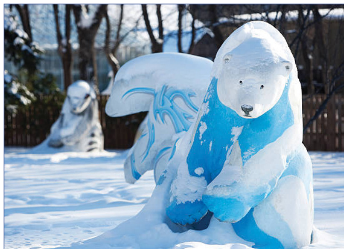
Several bear statues, known as the "Bears on Broadway," decorate the grounds of Manitoba's Parliament in Winnipeg.