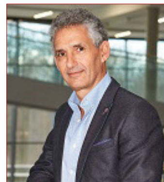
Professor Tim Spector