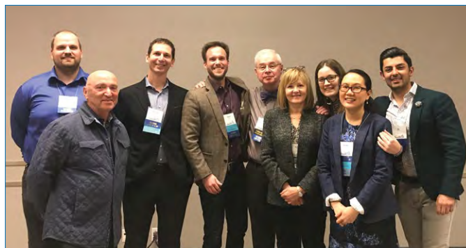
The mighty CRUS executive.