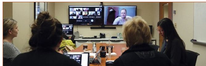
The interprofessional specialist team and community-based healthcare providers meet for their weekly ECHO session.

All patient cases are real, de-identified and presented by the health care provider participants. The patient cases are where the bulk of the learning occurs. They serve as a springboard for roundtable discussion of differential diagnosis, approaches to workup and treatment, and management.